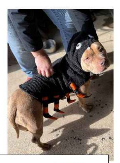
Bugs, Bugs and more BUGS!