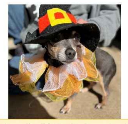
I'm so Thankful (we're almost done)!