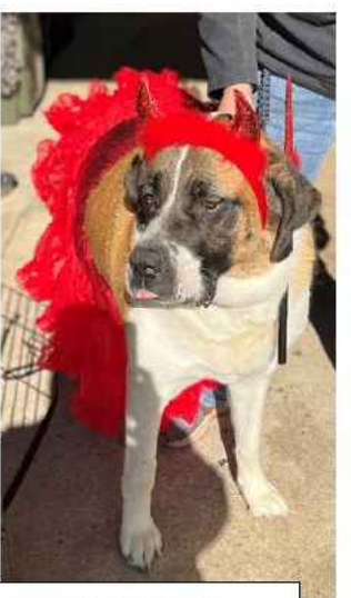
No, you're not! I'm the biggest and BEST Devil!